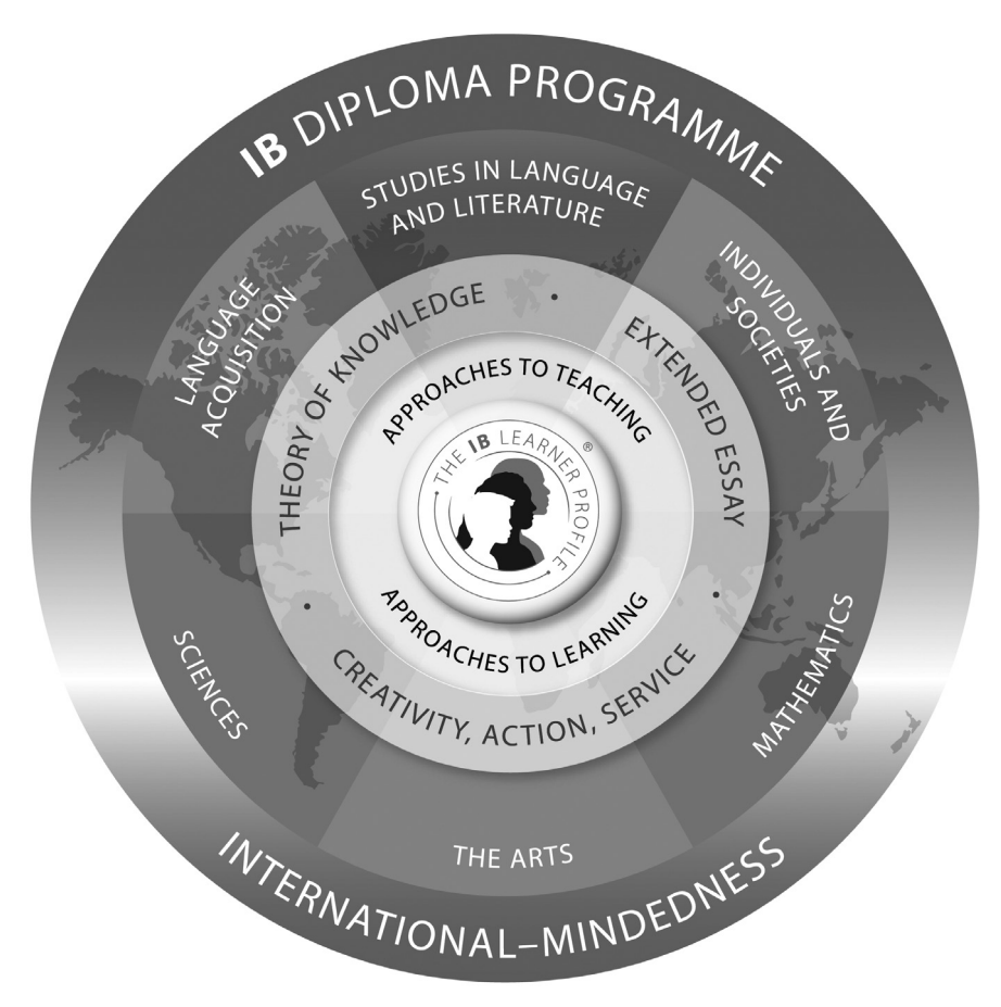
Figure 1 Diploma Programme model

The course is presented as six academic areas enclosing a central core (see figure 1). It encourages the concurrent study of a broad range of academic areas. Students study two modern languages (or a modern language and a classical language), a humanities or social science subject, an experimental science, mathematics and one of the creative arts. It is this comprehensive range of subjects that makes the Diploma Programme a demanding course of study designed to prepare students effectively for university entrance. In each of the academic areas students have flexibility in making their choices, which means they can choose subjects that particularly interest them and that they may wish to study further at university.